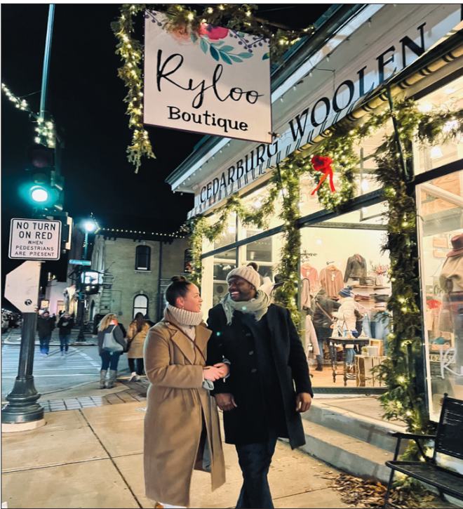
Cedar Creek Settlement on Friday, December 8.

If you're coming into town with the kids, make sure to drive through Illuminate Ozaukee at Zeunert Park in Cedarburg for a winter wonderland of holiday lights. Downtown, kids will delight at the full size Santa's Workshop right on Washington Avenue! Santa is there most Friday nights and Saturday mornings, but his time is limited and the house is run by volunteers, so please be patient and understand if there are long wait times or no spots available when you arrive. Families should also check out opportunities to enjoy Breakfast with Santa (December 2, Junior Women's Club) or Cookies & Milk with Santa (December 18, Ozaukee Family Services), or visit Santa at the