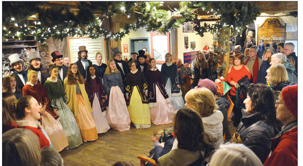
The Grafton High School Chamber Choir sings during a past Festive Friday Eve in the Shops of the Cedar Creek Settlement's Woolen Mill.