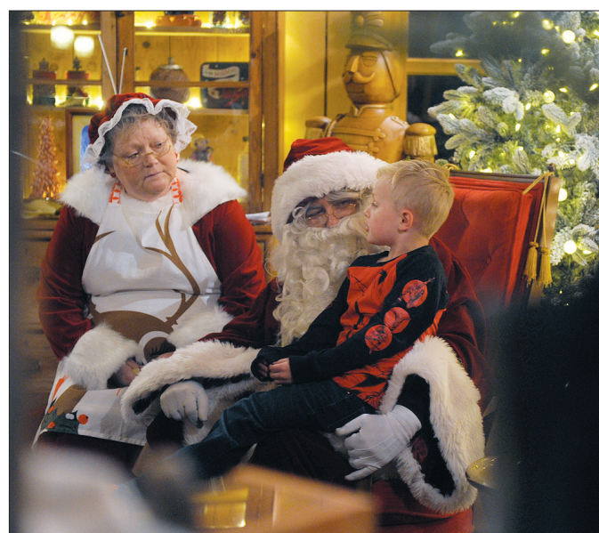
A child visits with Santa and Mrs. Claus in Santa's Workshop.

burg one of the Midwest's Six Best Holiday Shopping Towns.