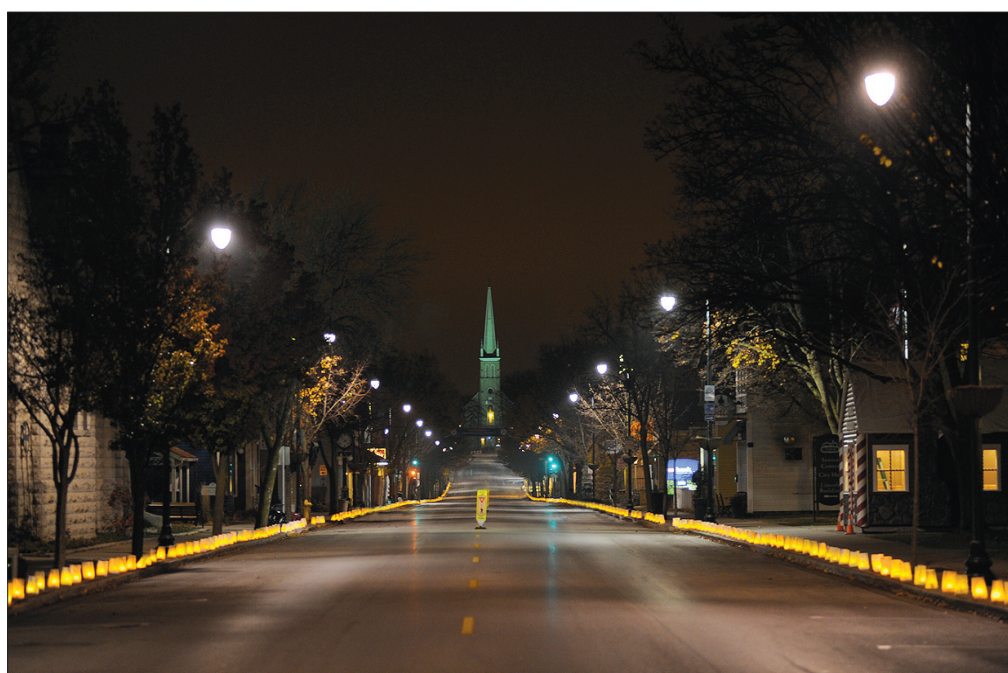
Luminary-lined streets are just one of the highlights of visiting Cedarburg during the holidays.

• OnlyInYourState.com printed the following headline last year: "The Most Enchanting Christmastime Main Street In The Country Is Cedarburg In Wisconsin." It cited everything from its decor to its bustling calendar of events. "Cedarburg's entire five-block downtown is listed on the National Register of Historic Places and during the holidays, it is magically transformed into something straight out of a movie or Norman Rockwell painting. It's quaint, charm-