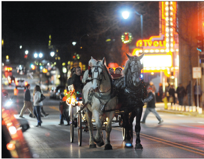
Visitors to downtown Cedarburg enjoy a holiday carriage ride.

Below is the full schedule of events: • "The Settlement Christmas Showcase": 5 p.m. to 8 p.m. Friday, Nov. 22: Kick off the Christmas season in the Settlement's boutiques featuring clothing, jewelry, handmade and imported items, antiques and artisan objects. Live