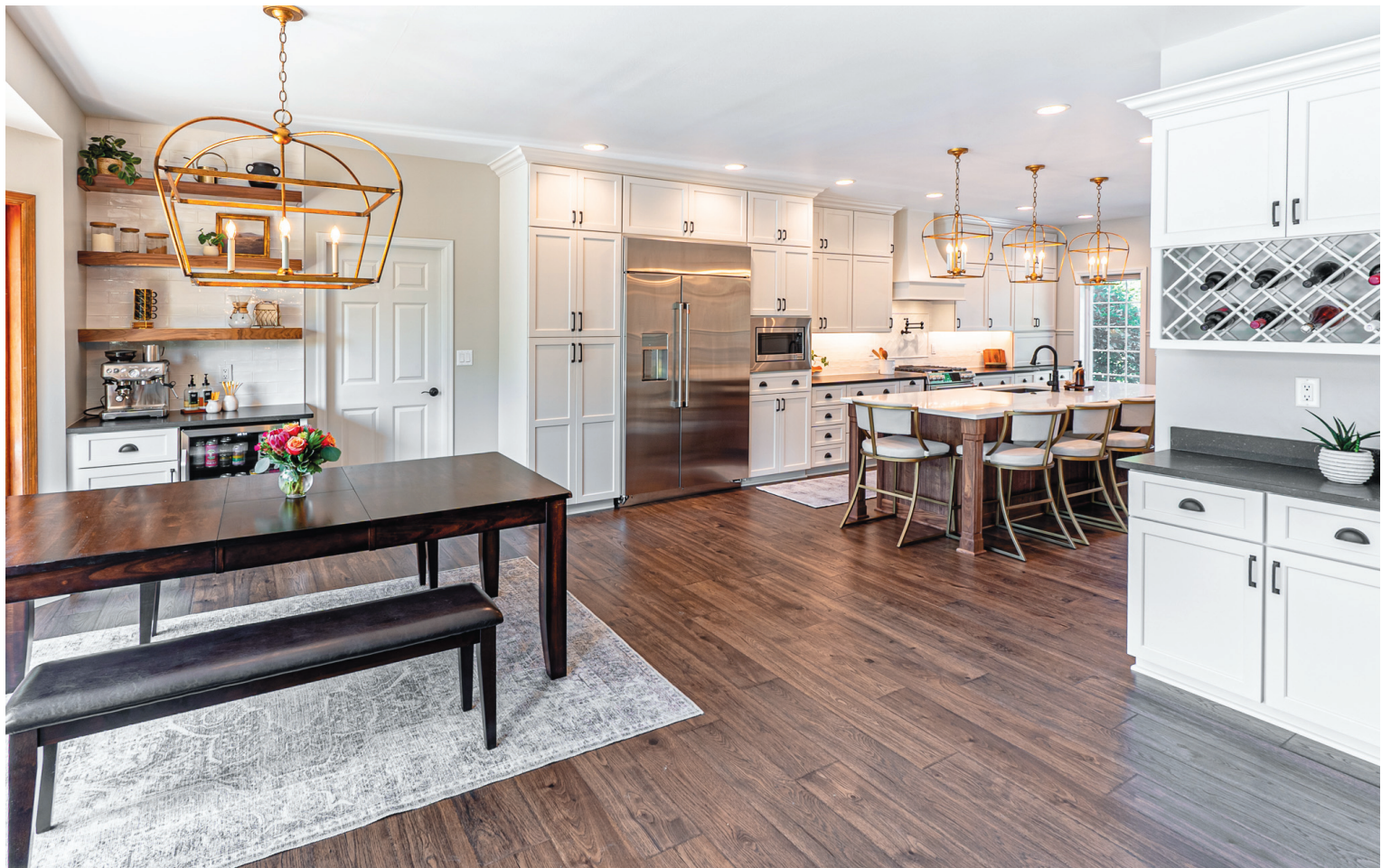
From builder-grade to a customized creation, this everyday Lake Country kitchen was transformed by Callen into a modern French Country Kitchen for a young family. The homeowners' vision to remove a dividing wall and merge the kitchen and dining room unlocked many possibilities, enhancing both form and function.