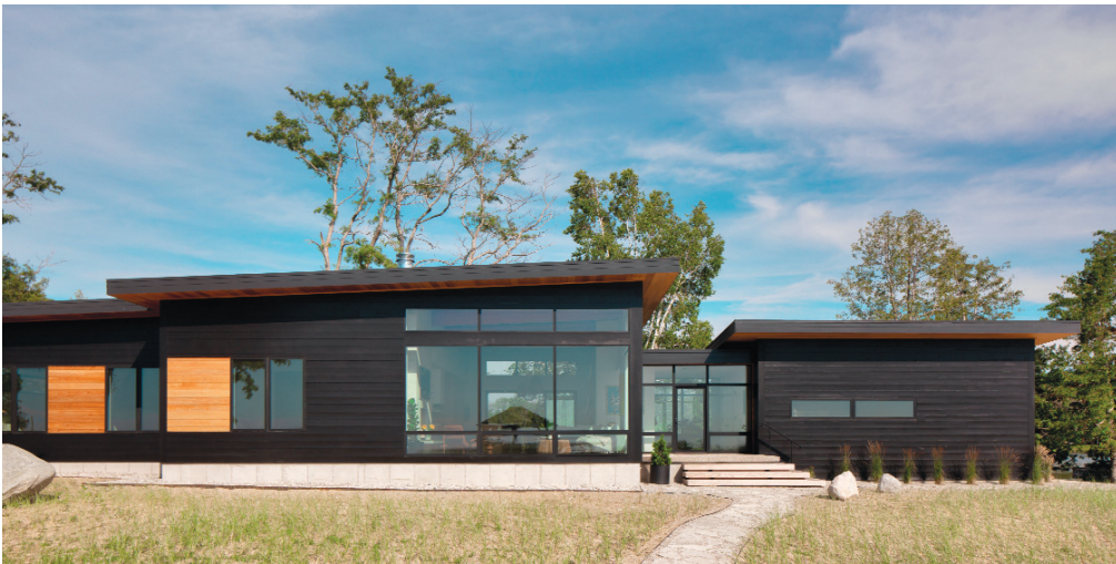
Architectural windows from Marvin Windows and Doors make a modern statement and help open the home to the outdoors.

might replace a simple bank of windows with a multislide or bifold door system.”