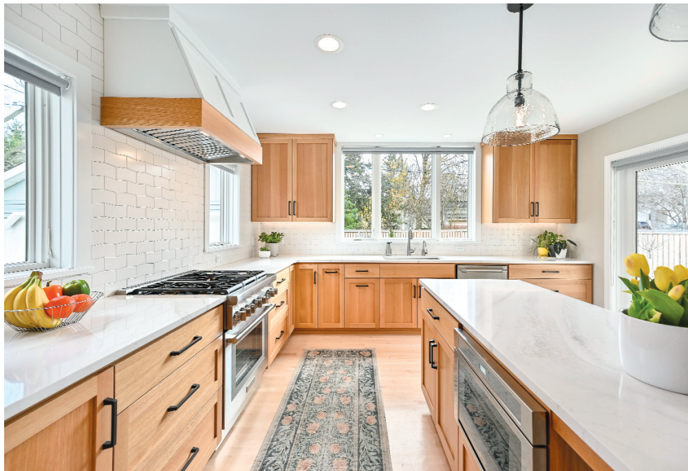
A kitchen remodel in Wauwatosa by Alair Homes Milwaukee has lots of natural light and a full tile backsplash that reaches all the way to the ceiling.