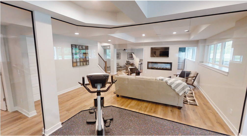
Glass walls from Wingspan Shower Door & Glass provide transparent separation between a workout room and TV room.

“For homeowners who have a soaking tub and shower area, a half glass wall can separate the two spaces in an 'inviting' way,” explains Mau-