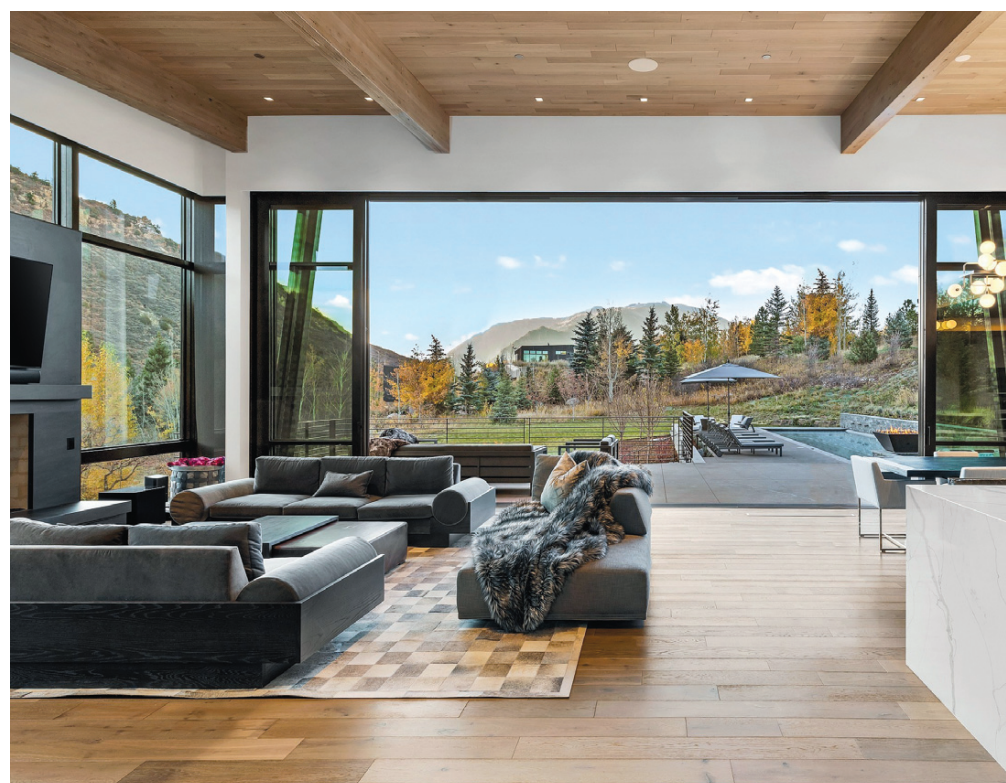
Oversized sliding glass doors from Weather Shield Windows & Doors create a "window wall" that blends indoor/outdoor living.