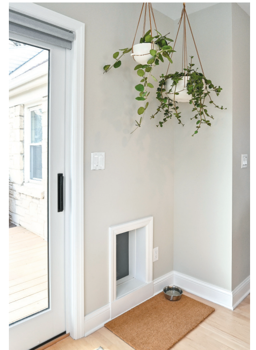
The Wauwatosa remodel also includes a custom dog door so Owen, the family's pet, can come and go as he pleases.