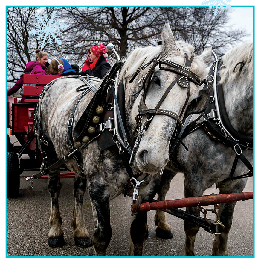
For a complete listing of JanBoree events go to JanBoree.org

There is something for everyone, so don't miss out on this exciting weekend! For more information and to see all JanBoree events, visit www.janboree.org or www.waukeshacountyparks.com.