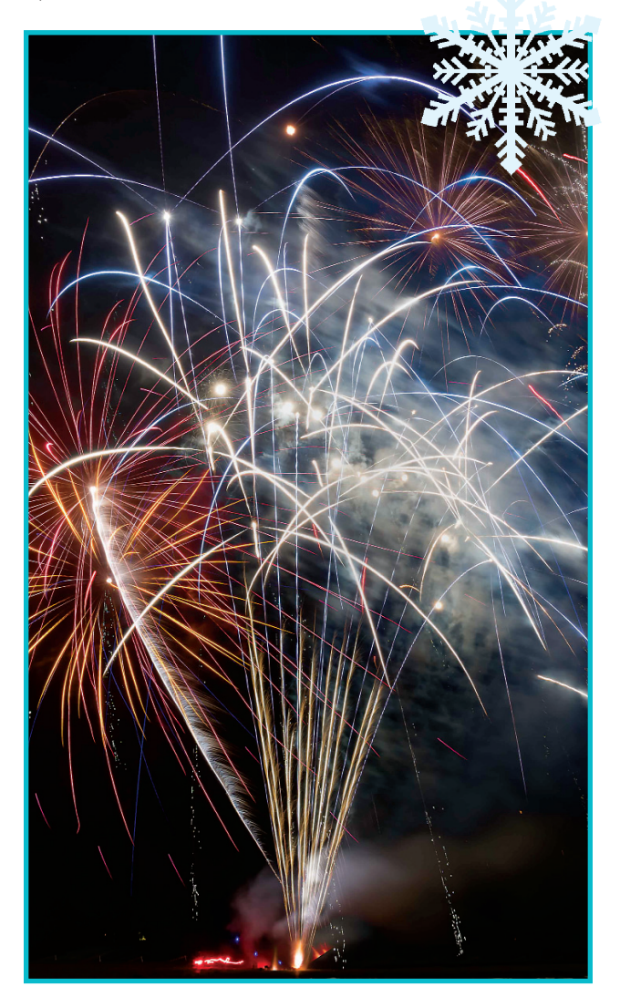
Check out the excitement and get in the game as the 33rd Waukesha JanBoree opens on Friday, January 26th at Lowell Park. For a full schedule of events go to janboree.org

And finally, as tradition would have it, you'll see fireworks light up the crisp winter sky at 8 PM. If you've never seen winter fireworks, you won't want to miss it as each punch of color pierces the winter sky and falling embers ranging the rainbow bang, flit, and fall into the snow.