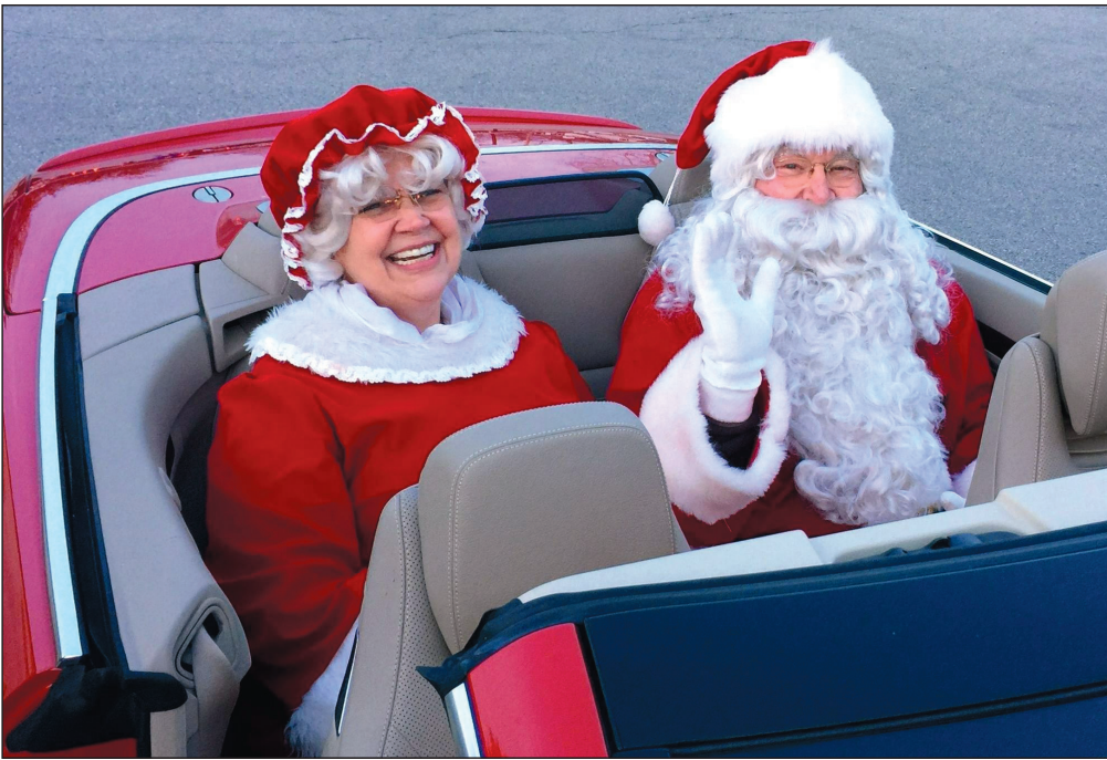
Santa &amp; Mrs. Claus - 2016

The Music Café – Live music all day, including Music Cafe Students 9-11am, PVMS Jazz Combo Performance at 1pm, Rock Shop Bands 1:15-3:15pm, MHS Jazz Combo at 7pm, MHS Jazz Vocals at 7:30pm, Dale's String Ensemble at 7:45pm, Jon Blessing Band at 8pm. Open 9am - 9pm.