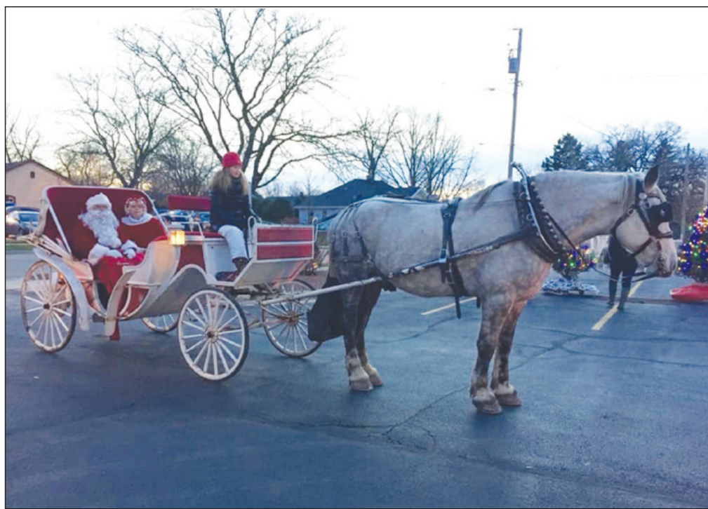
Carriage Ride- 2018