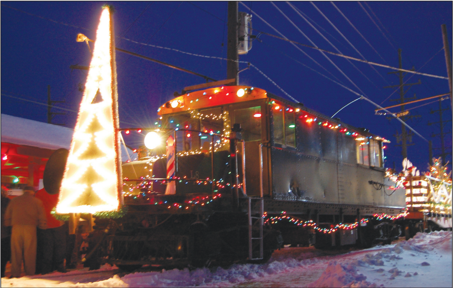
East Troy Santa Parade Train