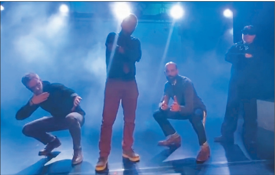
Teachers and staff performed during a rap event at Pewaukee High School on Jan. 9 in order to encourage students to attend a wrestling match.