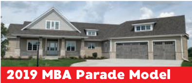
2019 MBA Parade Model WENTWORTH W201 N5308 Sandpiper Lane Aero Park, Menomonee Falls