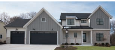
DELMAR W224N4599 Seven Oaks Drive Woodleaf Reserve, Pewaukee

See our 2nd Charleston model in Cedarburg