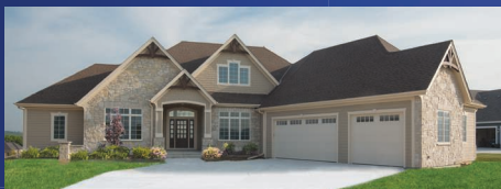
Castle Rock B KOHLER RIDGE, NEW BERLIN

As one of the area’s preferred custom home builders and the MBA’s 2018 Builder of the Year, we take heart in delivering handcrafted homes that embody the beautiful surroundings of the communities we build in. Our team’s passion ensures that every Victory home is built with extraordinary care and every promise we make is delivered. Each time we deliver the keys at a home closing we’re leaving behind a lifelong friend.