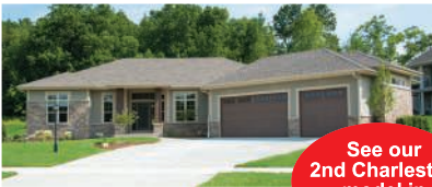
CHARLESTON N75 W23984 Overland Road Hidden Hills, Sussex

Visit our model homes to learn more! Open Saturdays & Sundays Noon to 4 PM. Closed holiday weekends