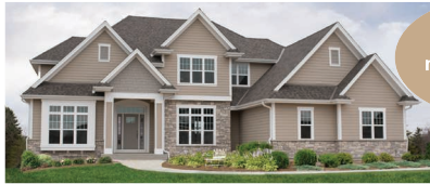
BRENTWOOD N81W4993 Sandhill Trails Sandhill Trails, Cedarburg

See our Newest Model in Oak Creek: the Brightwater!