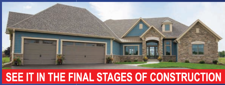
Brooklyn RANCH COURT, MEQUON