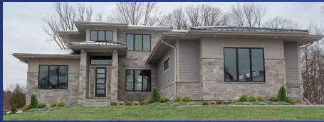
Augusta LILLY CREEK, BROOKFIELD