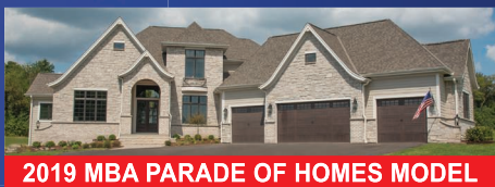
Geneva WHITE OAK CONSERVANCY, DELAFIELD