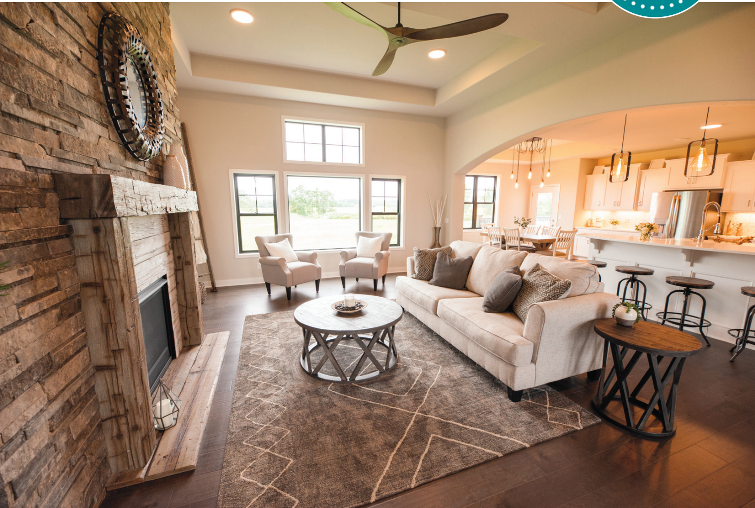
Belman Homes, Inc. – 2019 People’s Choice Best Overall Home Award

More than 30,000 visitors are expected to tour the homes over the course of the