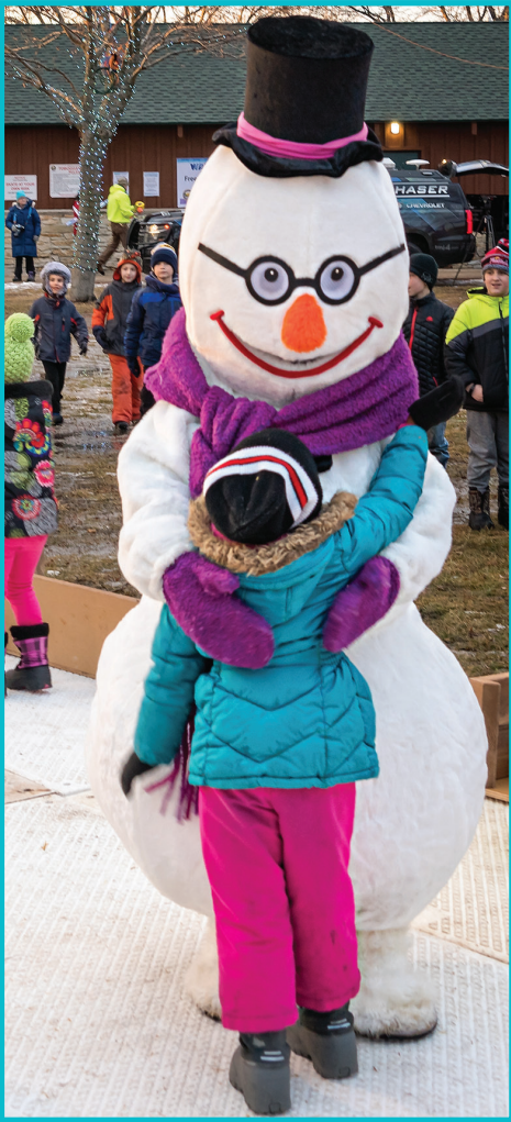
Printing courtesy of the Waukesha Freeman