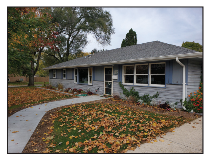
in 2016, recognizing the local need