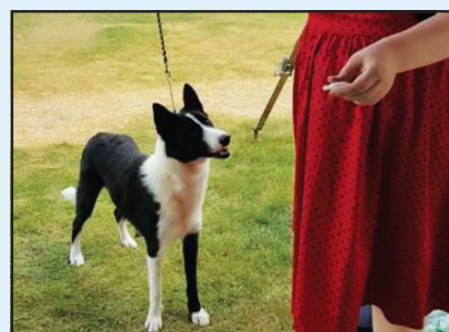
FSS Open Show