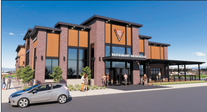
Rendering courtesy of WD Partners

The commission unanimously recommended for approval the plans for a single-story brick restaurant with outdoor seating and 96 parking spaces for 17430 W. Bluemound Road. The neighborhood and comprehensive plans for this area for this area aim to encourage density through horizontal and vertical mixed-use development. Commission staff says this project fits within the plans and zoning regulations. "I think it's classy; I'm glad it fits within our code," said Alderman Gary Mahkorn. "The architecture here is exceptional. It's 1,000% better than what's coming down from there — an old, dated building."