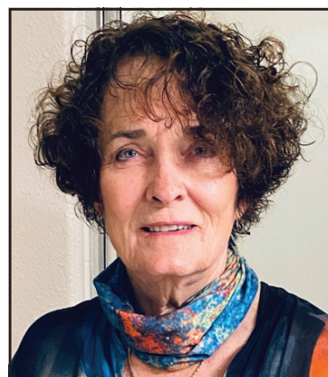
Shar celebrating 20 years

In every Comfort Keeper® is a heart and compassion to care for others. It is the power to lift lives every day.