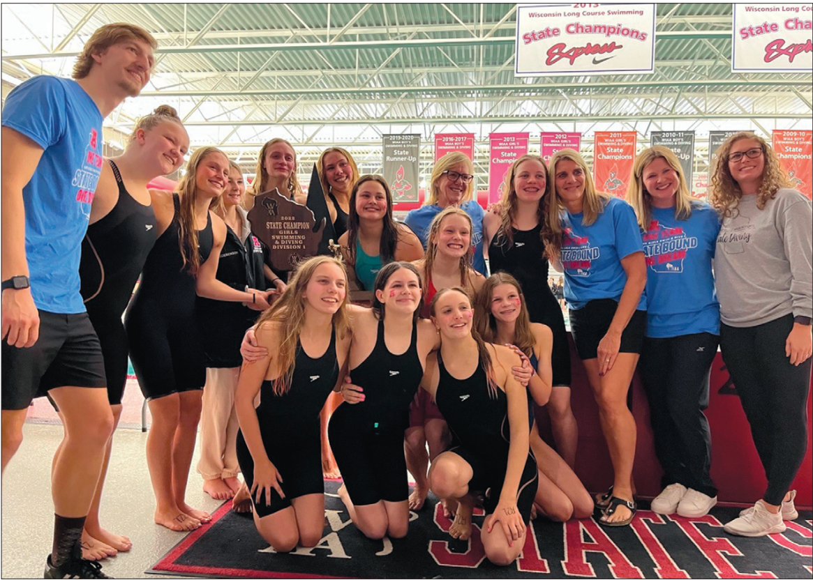
Arrowhead's girls swimming and diving team poses with the first-place trophy after winning the Division 1 team title during the WIAA Girls State Swimming and Diving Championships Nov. 12 at Waukesha South. The Warhawks put an end to Brookfield East's reign as Division 1 state champions.