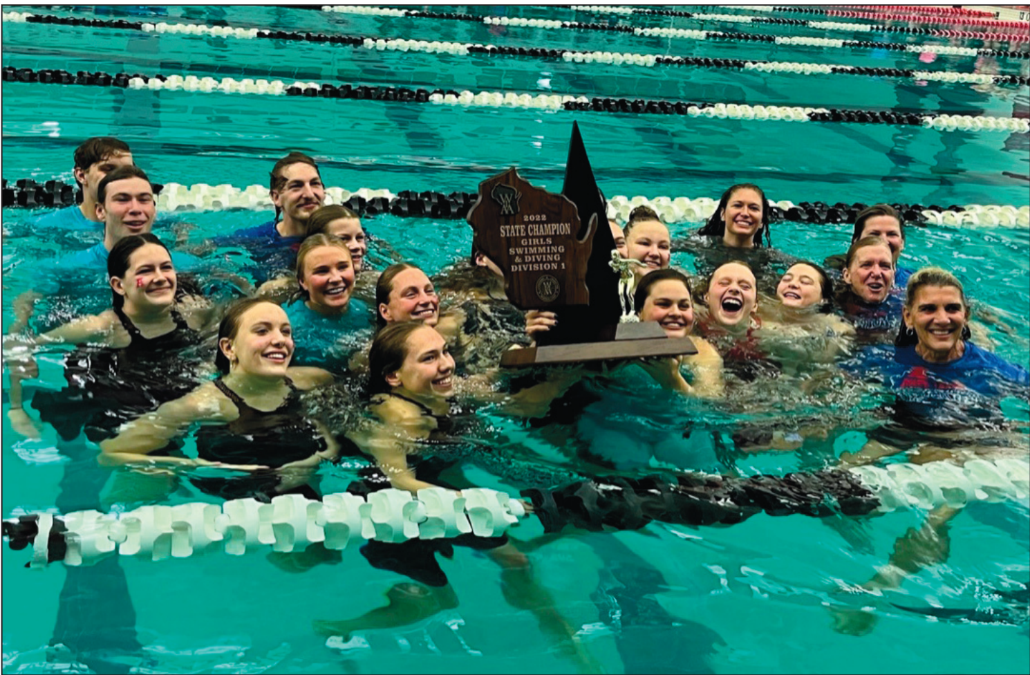
Arrowhead's girls swimming and diving team poses with the first-place trophy after winning the Division 1 team title during the WIAA Girls State Swimming and Diving Championships on Nov. 12 at Waukesha South.