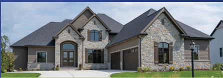
2021 MBA PARADE OF HOMES AWARD WINNER!