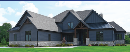
Cambridge II MEQUON