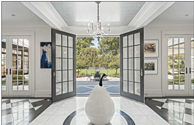
A door opens to a courtyard outside the $3.8 million home.