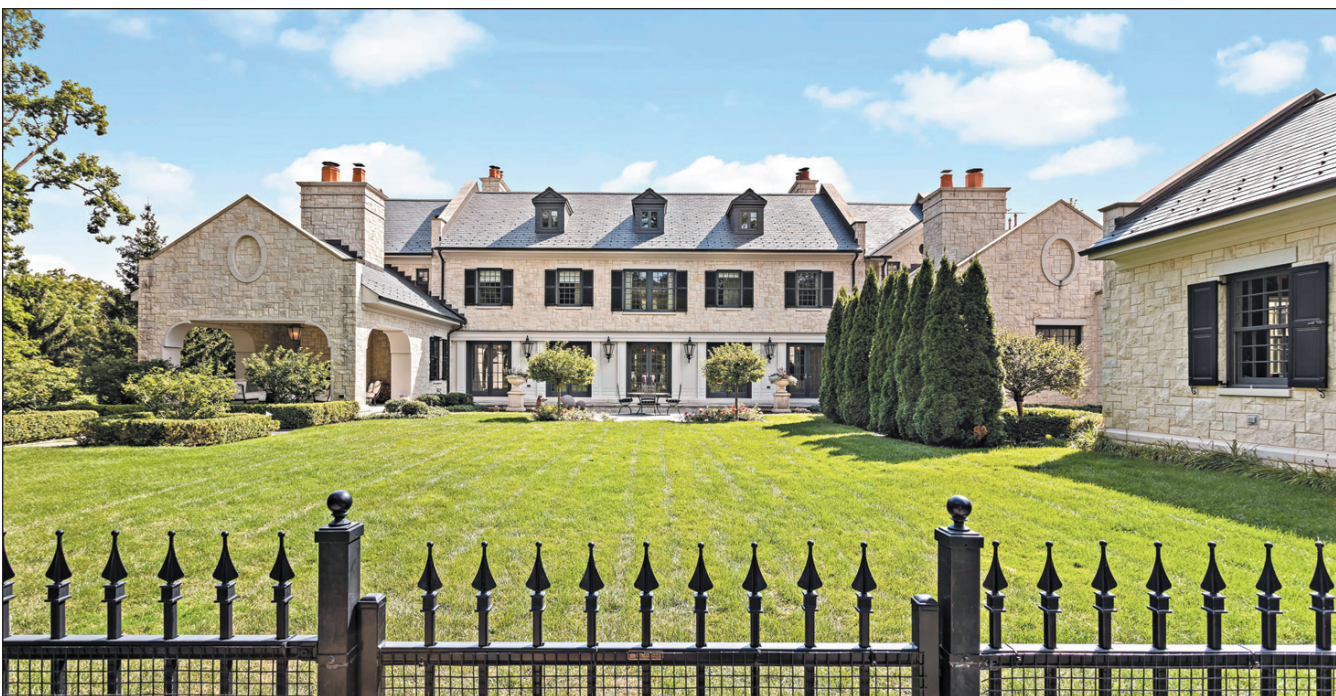
This $3.8 million dollar English Manor home was built in 2009 and lies in Elm Grove. Inside the home includes an arcade area with a bar, a home theatre, gym, This side includes a home theater, a large gym in the basement, an arcade room with a bar.