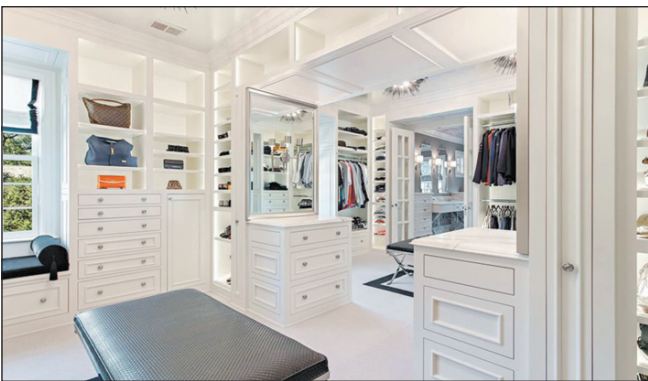
A large walk-in closet for the clothes horse with drawers for storage. Each room has a spacious walk-in closet.