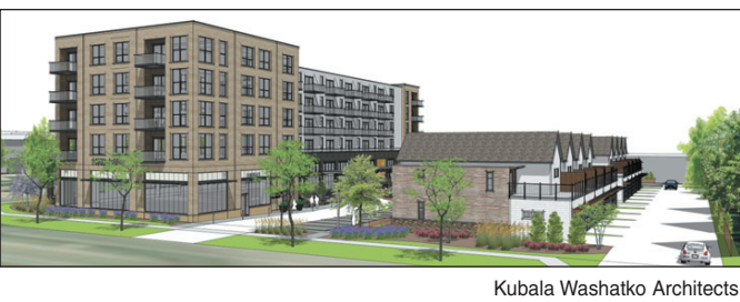
A proposed mixed-use building with 10 townhomes is proposed at the corner of Capitol Drive and Lilly Road in Brookfield.