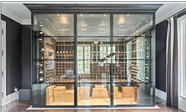
The Elm Grove home has a wine room to fit an large amount of wine.