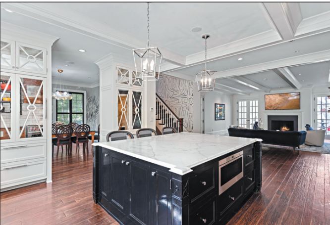
The kitchen is spacious and connects to a gathering place complete with a fireplace.