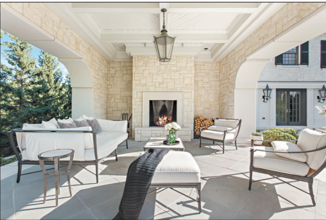
The outside patio has an outdoor fireplace making it a cozy place to entertain and stay warm in colder months.