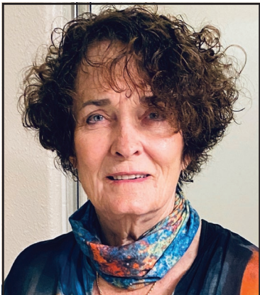
Shar celebrating 20 years

In every Comfort Keeper® is a heart and compassion to care for others. It is the power to lift lives every day.