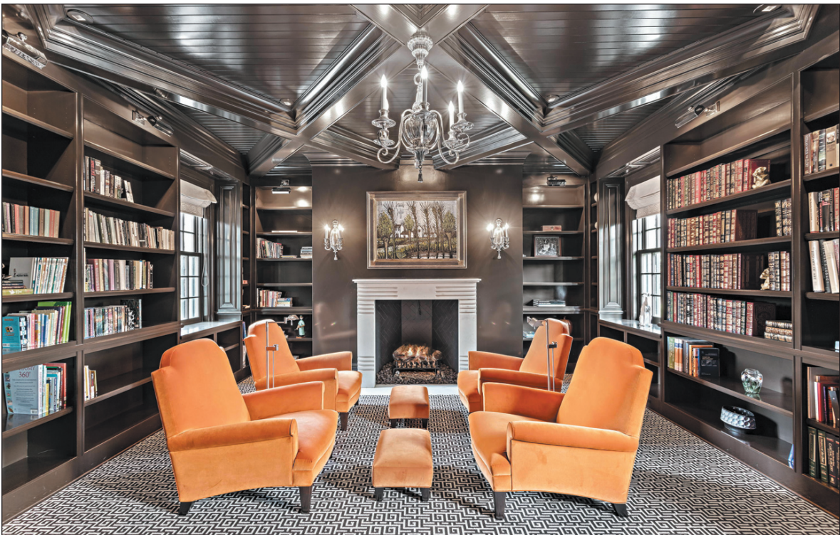
A library with ample shelving for the book lover and fireplace to cozy up with a book.