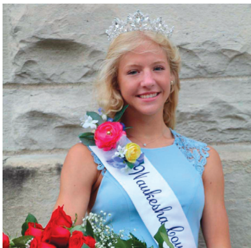
Submitted by The Waukesha County Fair Association

The Fairest of the Fair candidate is someone that should be proud to hold the position and become a standout addition to the community. In 2020, the Waukesha County Fair Association looked at the program to see about any improvements that they could make. The goal was to continue