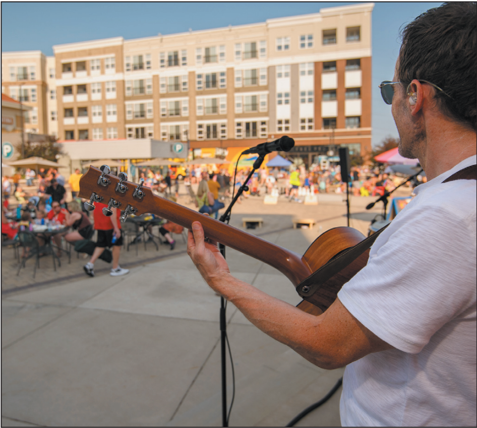
“The Acoustix” play “Why Georgia” by John Mayer.