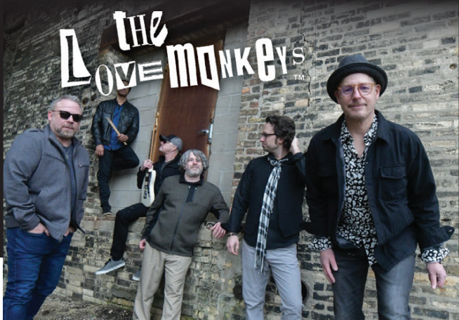
THE LOVE MONKEYS • 7:30 PM

HARTLAND CHAMBER OF COMMERCE hartland-wi.org