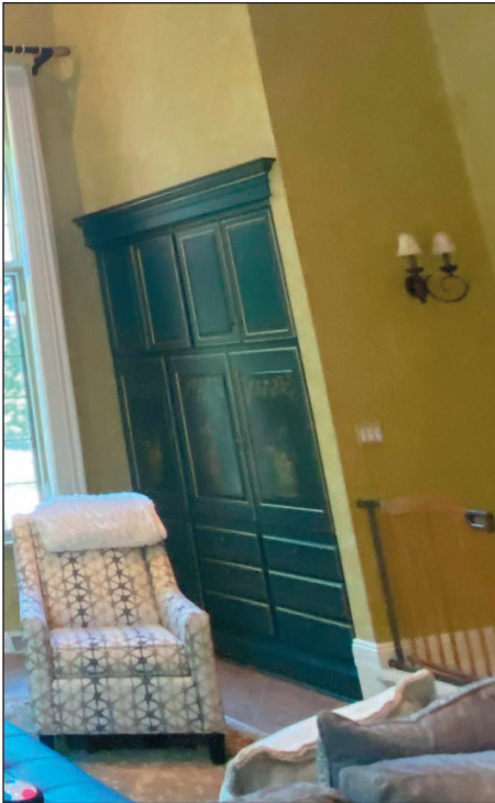
A living room before a refresh project by Karen Kempf Interiors. Karen Kempf said repainting, wall papering and moving furniture are good ways to refresh a room.