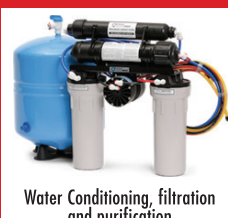
Water Conditioning, filtration and purification