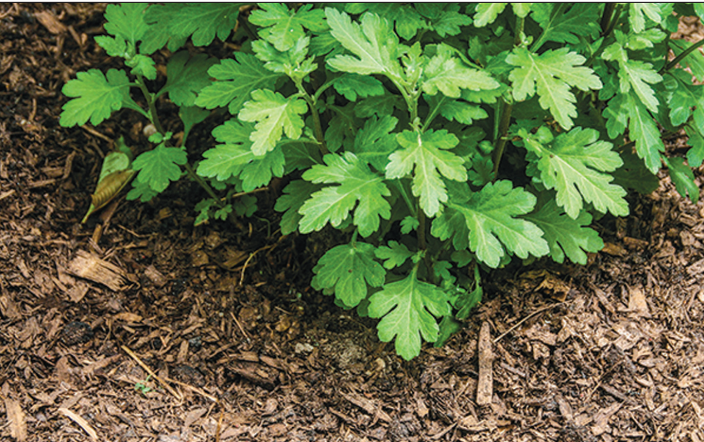
Adding a layer of mulch around plants can insulate roots and the soil against hard frosts.