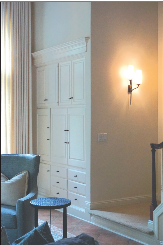
A living room following a room refresh project by Karen Kempf Interiors.