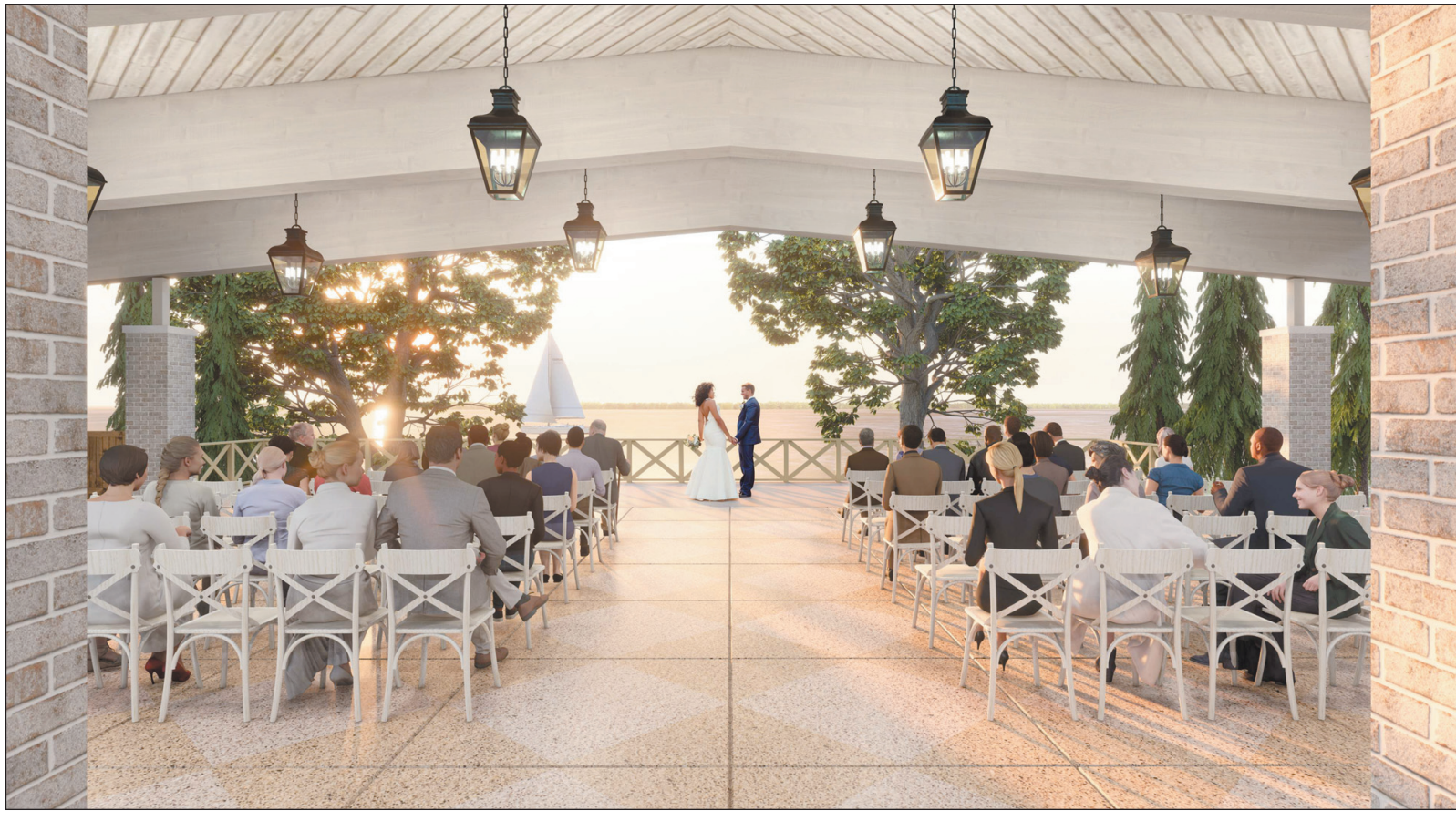
Renderings courtesy of The Bartolotta Restaurants

Inside, The Grand Heritage Room pays homage to the 1970s, when the property was known as Heritage on the Lake and Spirit of '76 Resort & Disco, and it was known to host celebratory and lively parties, according to the news release. This ballroom space on the top floor provides a