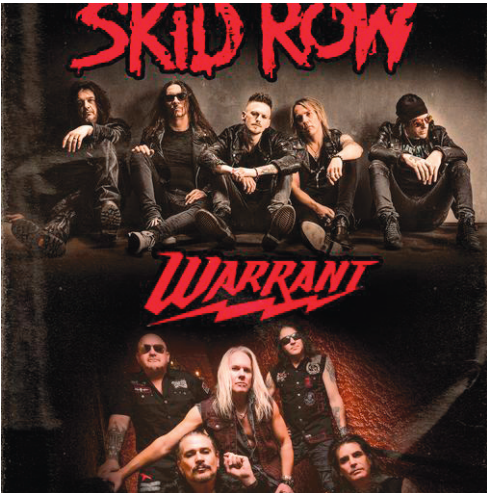
It'll be a night to let your hair down when The Gang's All Here Tour, featuring Skid Row, Warrant and Winger, visit the Main Stage on Saturday.