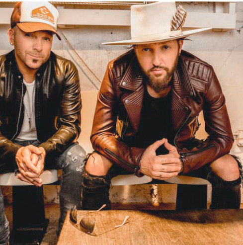
LOCASH kicks off the Main Stage acts at the 2023 Waukesha County Fair with a performance Thursday night.

LOCASH, Skid Row, The LoveMonkeys among fair headliners