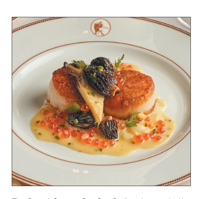
The Commodore - A Bartolotta Restaurant is located at 1807 Nagawicka Rd., Delafield, on the shores of Nagawicka Lake.