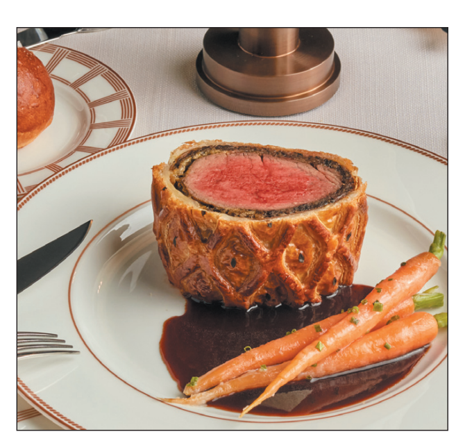
The Beef Wellington for Two from The Commodore - A Bartolotta Restaurant which includes a 16-ounce prime, barrel-cut filet baked in puff pastry with mushroom duxelles and a black truffle-périgourdine sauce.