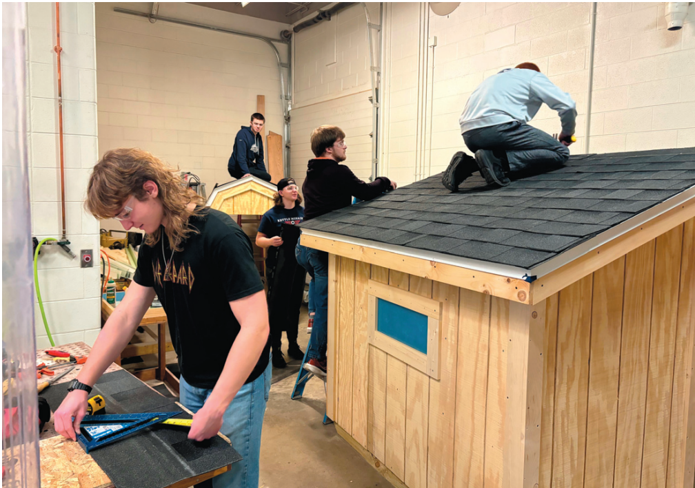
Students from Kettle Moraine High School measure and install shingles on their playhouses in the school's workshop.

MBA partners with area high schools to provide hands-on building experience