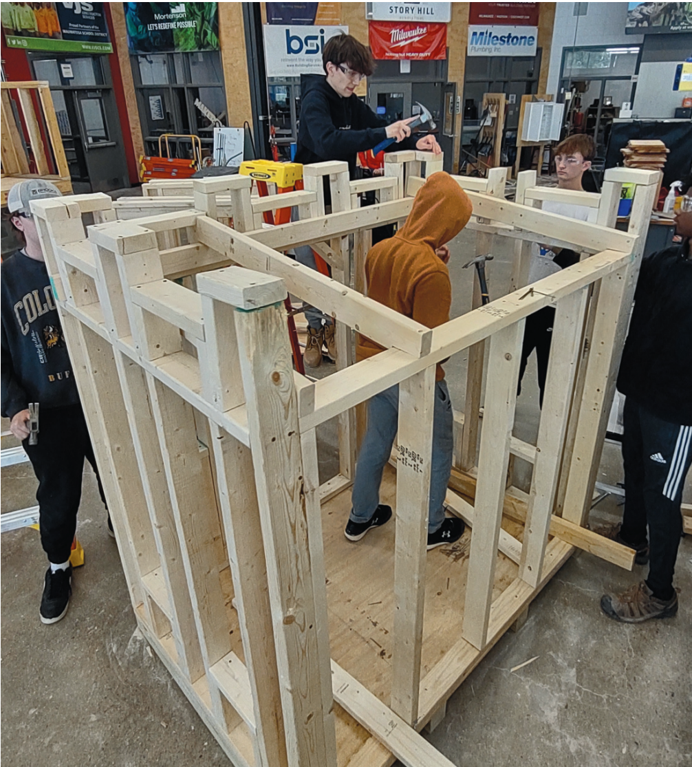
Students start construction on their playhouse at Wauwatosa East High School.

"It is so rewarding to provide students with