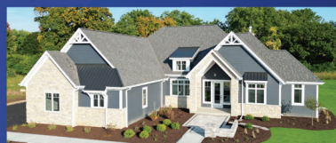
The Dover Grand