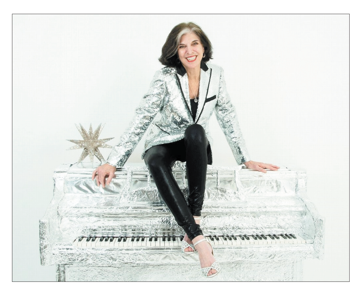
Marcia Ball will headline the 2025 Waukesha Rotary BluesFest on Aug. 9.