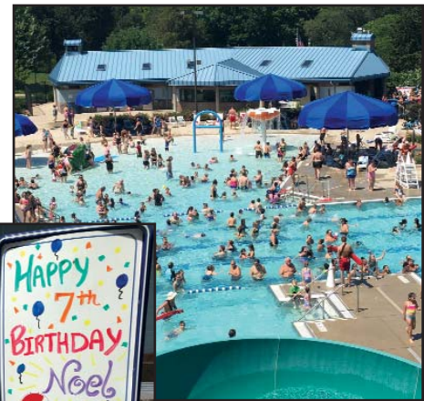
Horeb – 330 Spring St.