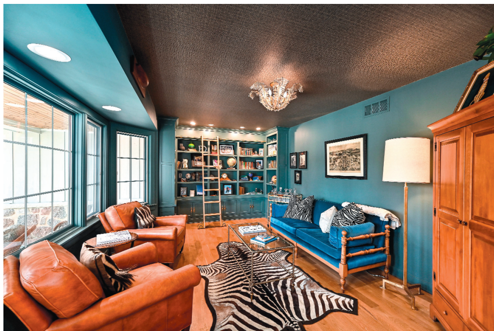
Alair Homes Milwaukee completed a whole home remodel in Elm Grove that, among other dramatic changes, includes a cozy library and a guest bathroom with a stylish vanity and eye-catching wallpaper.

“We used the leaded glass in the sliding doors of the pantry and then incorporated a similar glass design into cabinet doors above the wet bar to tie it all together,” says Weiher.