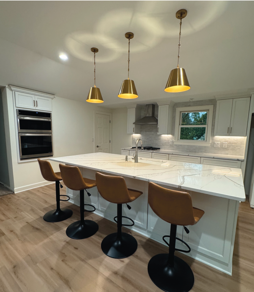
This 1970s ranch now has an open kitchen after a wall was removed and the space was remodeled by Lifetime Renovations.

Take a tour of some of the area's most impressive home remodels and design showrooms as part of the NARI Milwaukee Tour of Remodeled Homes, May 17-18. Tickets to the tour are free and can be downloaded at NARIMilwaukee.org/Tour .