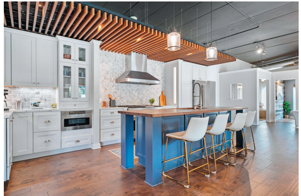
Kelmenn Homes in Wauwatosa designed its showroom to feel comfortable and welcoming for those who are thinking about remodeling their home.

To visit the four showrooms and 13 remodels and new construction homes that are part of the NARI Milwaukee Tour of Remodeled Homes, sign up for free tickets and get a tour map at NARIMilwaukee.org/Tour .