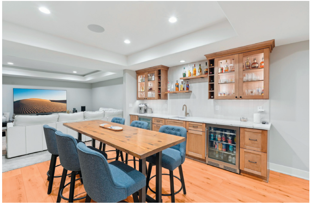
Lifetime Renovations completed a basement remodel that includes something for everyone in the family -- a theater, bar, golf simulator and bedroom.

Custom elements continue with a cozy library.