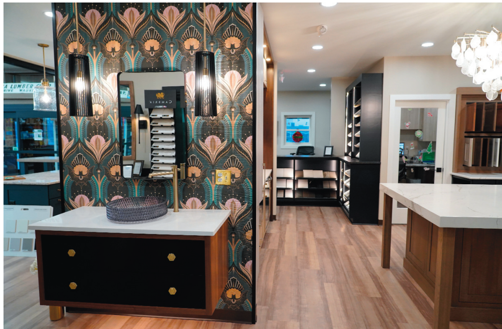
Bliffert Lumber & Design recently remodeled its Waukesha location and has a number of kitchen and bath vignettes that showcase a variety of design options.