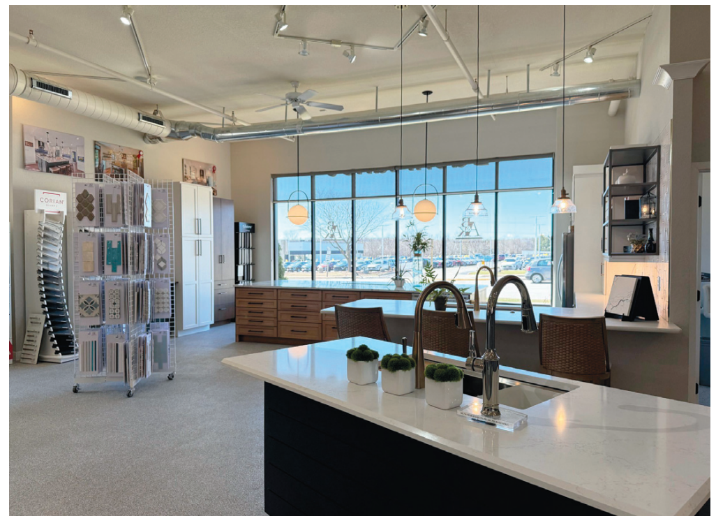
AB&K Bath & Kitchen in Greenfield will be open on May 17 - 18 as part of the NARI Milwaukee Tour of Remodeled Homes.